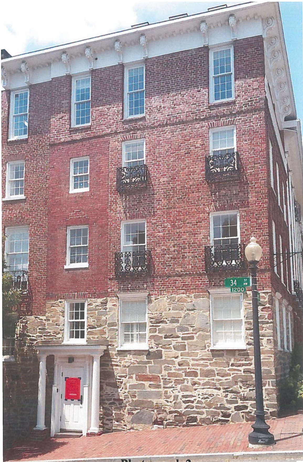
Photograph 2 34th Street, NW Application No. 19805